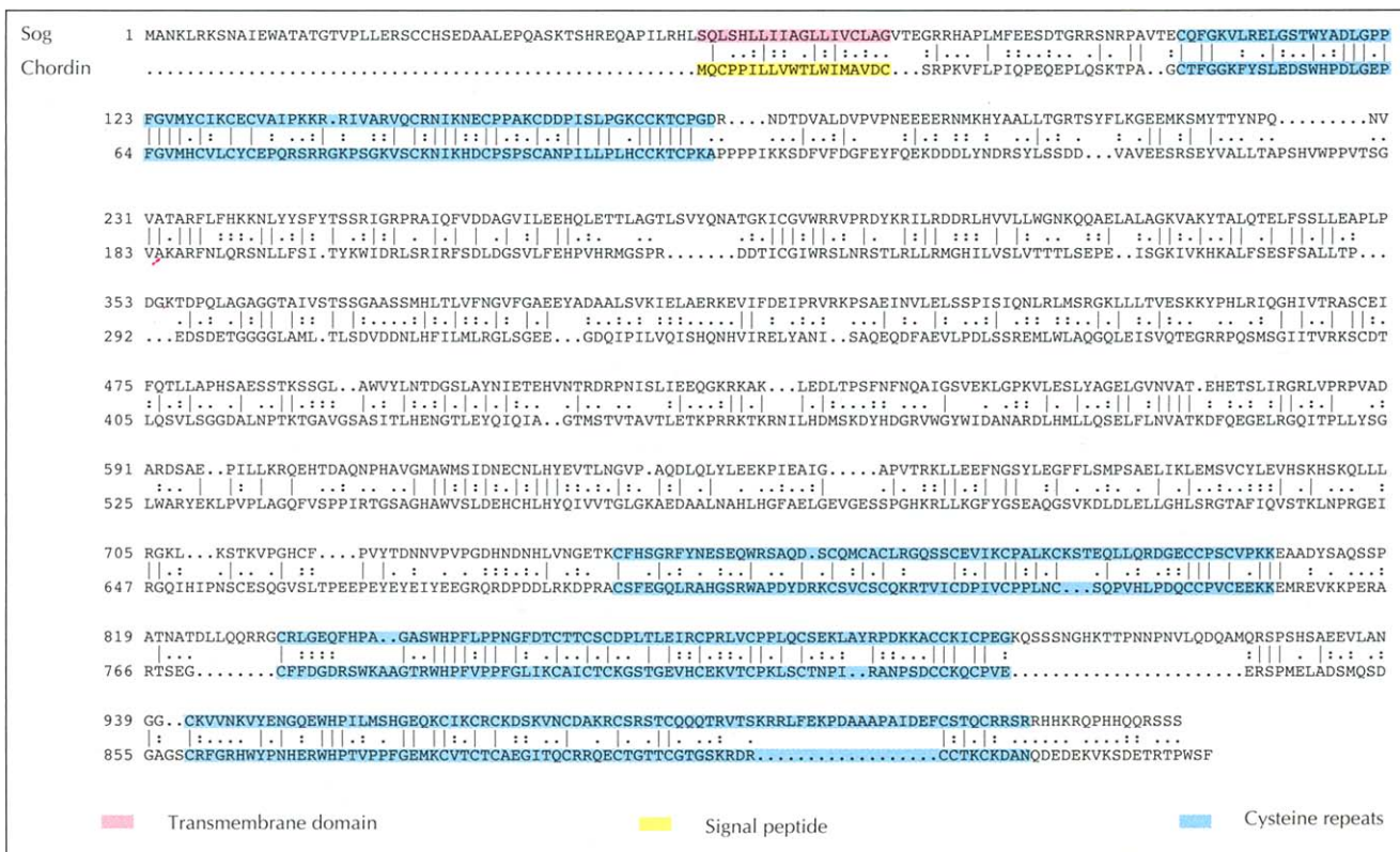
Fig. 3. Comparison of the amino-acid sequences encoded by the Drosophila gene sog (top line) and the Xenopus gene chordin (bottom line). The proposed transmembrane domain of Sog, the signal peptide of Chordin, and the cysteine repeats of both Sog and Chordin are indicated. Redrawn from [16].

The biological effects of chordin are similar to those of gooseoid . In particular, overexpression of chordin in ventral cells of the Xenopus embryo causes secondary axis formation, and chordin is also able to rescue normal development of the dorsoventral axis in embryos made radially ventral by ultraviolet irradiation of their vegetal hemispheres shortly after fertilization [4]. In these respects, the effects of chordin are also similar to those of other genes expressed in the organizer, such as noggin [8]. To see how chordin might be involved in the regulation of BMP-4 activity, however, it is illuminating to compare the effects of chordin with those of a truncated BMP-4 receptor [9]. It has been known for some time that overexpression of BMP-4 in the Xenopus embryo causes dramatic ventralization in a dose-dependent fashion [10,11], and that